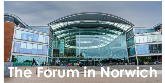
The Forum in Norwich