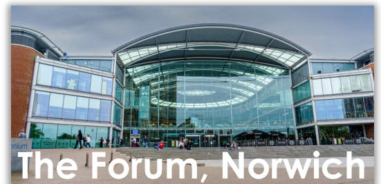
The Forum, Norwich